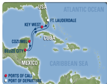
2008 Western Caribbean

Experience the relaxation of a cruise as you visit some of the most wonderful destinations in the Caribbean including Key West, Cozumel and Belize City.